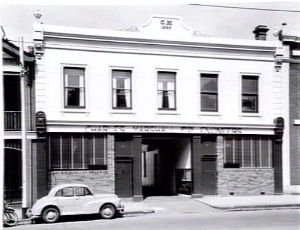
No 44 during the time of Charles Marshall

Prior to 1878, numbers 44 – 46 Brunswick Street had a variety of uses including livery stables, printers, a piano factory, and sewing machine depot. The current two storey building on number 44 was erected in 1880 for owner John Mann. The centre-opening shown on the photograph led to livery stables at the rear, with shops on either side and rooms above. From 1879 to 1880, the rate book valuation of the property increased from £14 to £90, and the 1880 property description was "livery yard, & Brick Stone 2 shops, 8 rooms" In 1885 the southern shop was occupied by the Albany Milk Depot, and at