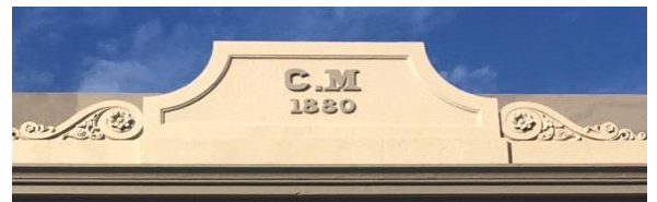
Parapet of 44-46 Brunswick St.