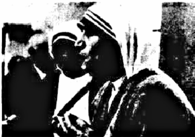
Mother Teresa at Fitzroy Mission in Melbourne this week.

old, the sick and the unwanted, "the poorest of the poor", as she put it.