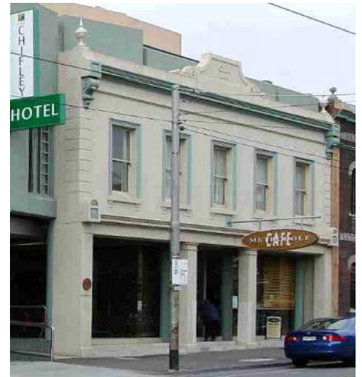
44-46 Brunswick St. today